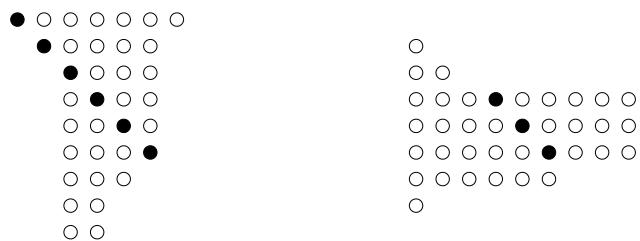
Figure 2.1: The Wright's Representations.

The generating functions (2.3) and (2.4) can be deduced from the Wright's bijection [19] for the Jacobi's triple product identity. Let us recall that a synchronized F -partition S(\alpha, \beta) with a discrepancy k can be represented as follows: put r solid circles on the diagonal, where r is equal to the number of parts in \alpha . Then for j = 1, 2, \dots, r , put \alpha_j - 1 circles in row j to the right of the diagonal and \beta_j circles in column k + j below the diagonal. For example, Figure 2.1 gives the representations of the synchronized F -partitions \begin{pmatrix} 7 & 5 & 4 & 3 & 2 & 1 \\ 6 & 5 & 2 & 0 & * & * \end{pmatrix} and \begin{pmatrix} 6 & 5 & 4 & * & * & * \\ 7 & 5 & 4 & 3 & 2 & 1 \end{pmatrix} .